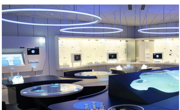
Daiichi Sankyo KUSURI(Medicine) Museum